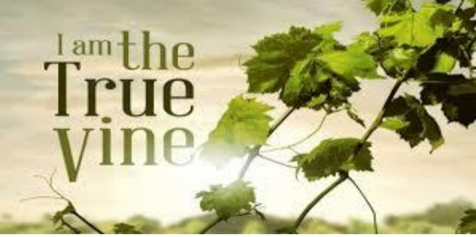
"Children, let us love not in word or speech but in deed and truth." -1 John 3:18

Regarding our Catholic faith, do you "walk the talk?" Do your actions reflect what it means to be a good disciple? Are you an active participant at Sunday Mass? Are you joyful when participating in parish ministry? Do you give gratefully and generously with your financial support to your parish and other Church needs? If not, it's not too late to start!